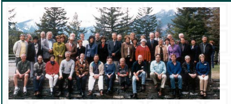
IFLA World Council Meeting Banff, Canada May, 2003