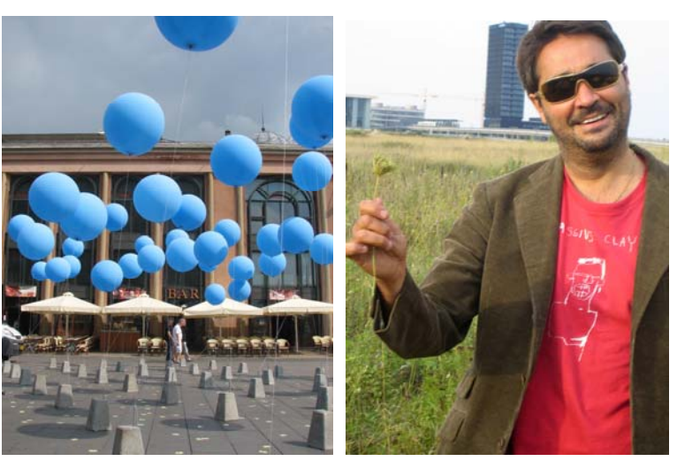
The forest of blue ballons