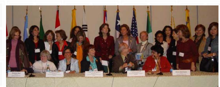
IFLA Western Region participants at the Lima Conference, November 2005