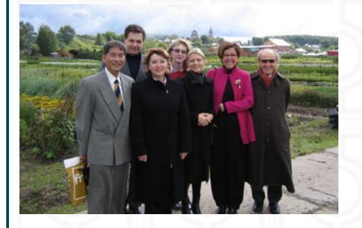
IFLA CR Conference Moscow, Russia September 2003