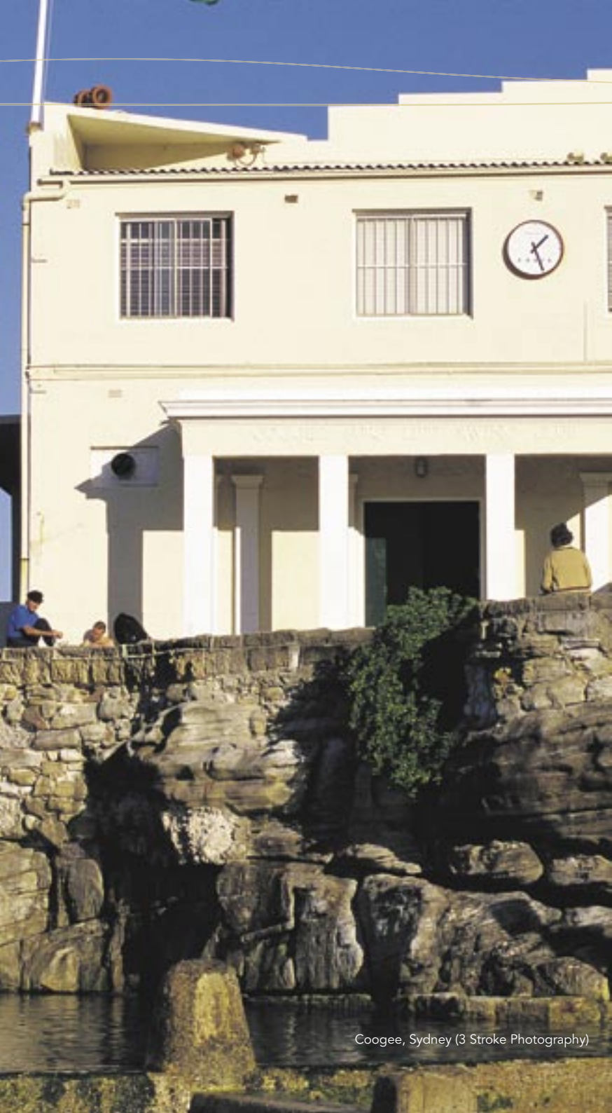
Coogee, Sydney