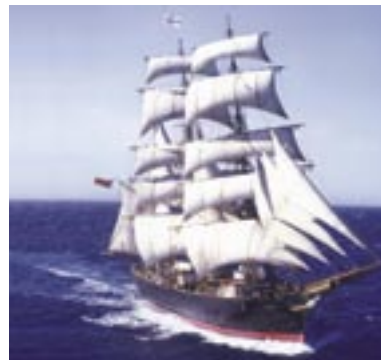
The James Craig Historic Tall Ship