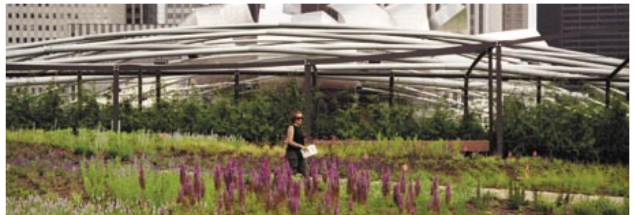
The Lurie Garden, Millennium Park.

Her advocacy extends beyond traditional landscapes to include transportation corridor planning and design through leadership in statewide support for Context Sensitive Solutions. Astrid spoke at the first Security Design Coalition Conference in 2003 for "Safe Spaces: Designing for Security and Civic Values", advocating a sensible balance between security measures and preservation of public access to public places, and on a similar subject recently at the 2005 Canadian Society of Landscape Architects' Annual Congress.