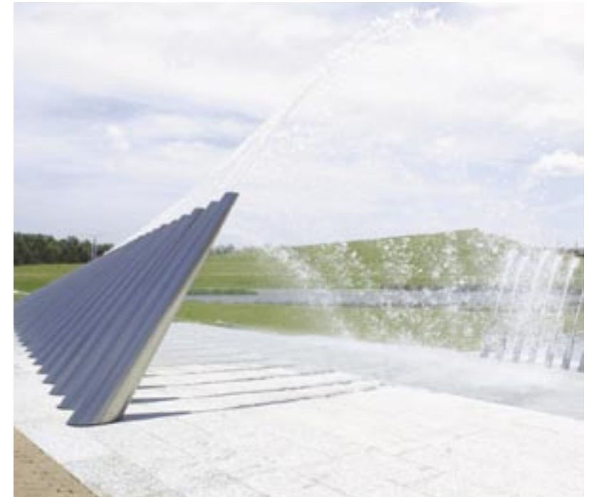
The Northern Water Feature, Sydney Olympic Park

Due to the extensive ongoing use of Bicentennial Park for picnicking and casual recreation, an additional destination was required so that the parklands at Sydney Olympic Park become Sydney's premier recreational destination. Wentworth Common has been identified for this purpose. An important objective of the new work is to ensure that an effective and robust planting scheme was implemented. The aim is to make the venue distinctive as a physical and visual entity. This implies that the outcome of the planting design will present to the visitor a sense of uniqueness distinguishing this as a special destination.